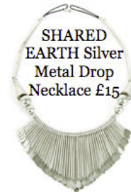
SHARED EARTH Silver Metal Drop Necklace £15