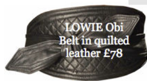
LOWIE Obi Belt in quilted leather £78