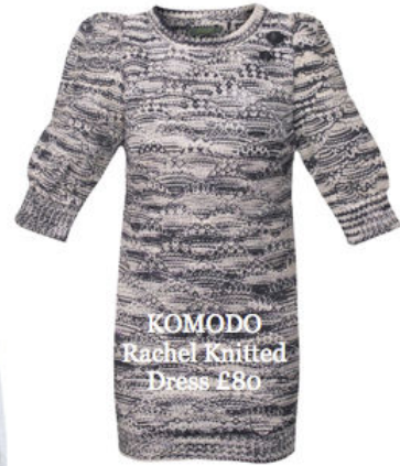
KOMODO Rachel Knitted Dress £80