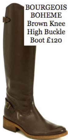
BOURGEOIS BOHEME Brown Knee High Buckle Boot £120