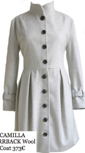
CAMILLA NORRBACK Wool Coat 373€