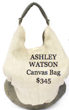
ASHLEY WATSON Canvas Bag $345