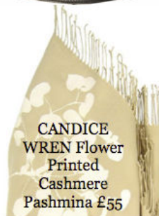
CANDICE WREN Flower Printed Cashmere Pashmina £55