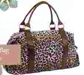
Animal Magic Bag £28 Accessories