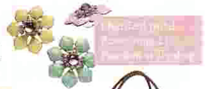
Pastel Jewellery £10.99 Primark £12.99 Primark

Ice cream shades are big this spring, floaty fabrics create a pretty feminine look