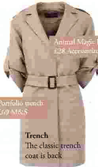
Portfolio trench £69 M&S