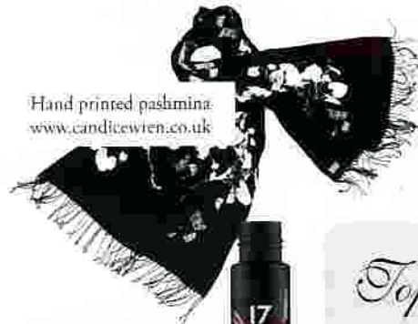
Hand printed pashmina www.candicevien.co.uk