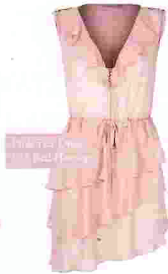
Chic Pastel Dress £18.99 Primark